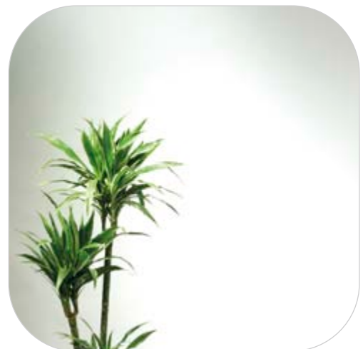
Pilkington Optimirror™ OW