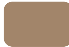
Medium Brown 6028