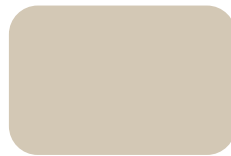
Pilkington Activ™ Brown 4055