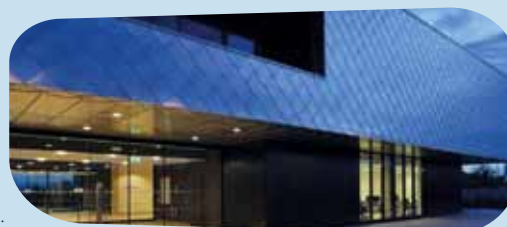
Circle Bath Hospital, Bath.