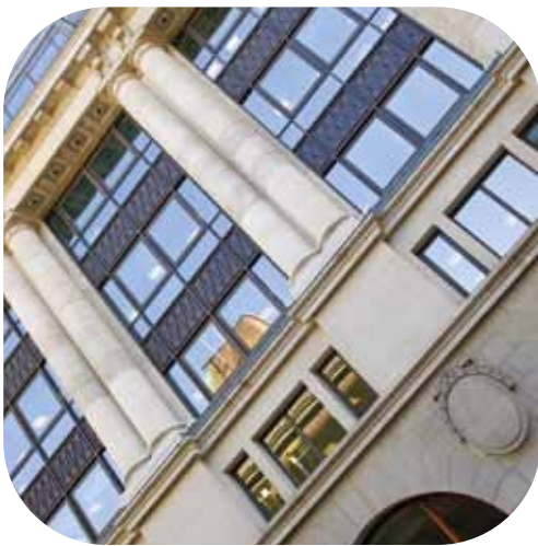
Old Jewry, London.

Our company has been manufacturing and processing glass since 1826. This experience has been invaluable and has enabled us to invest in and develop our ideas into a range of market leading products.