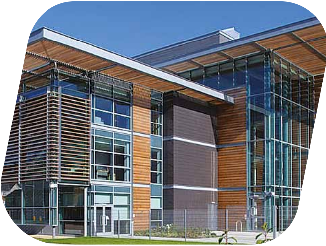
Welsh Assembly, Wales.

We will be pleased to provide information and advice on all enquiries, orders and contracts for Pilkington Insulight™ units.