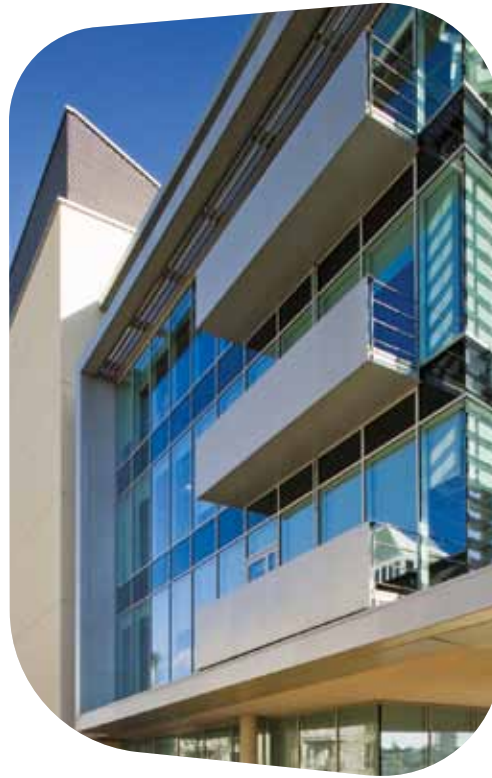
Lloyds Bank, Bristol.