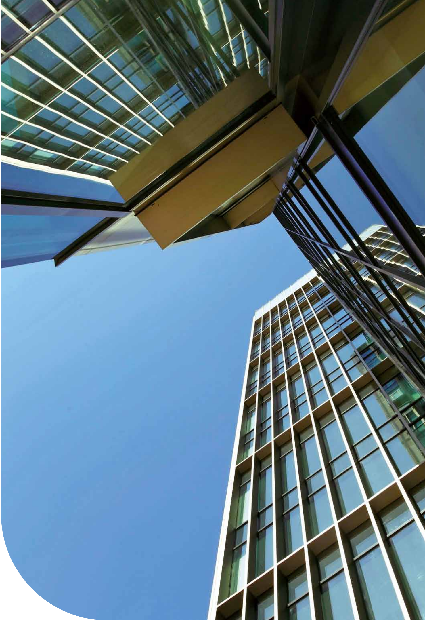
Brindley Place, Birmingham.