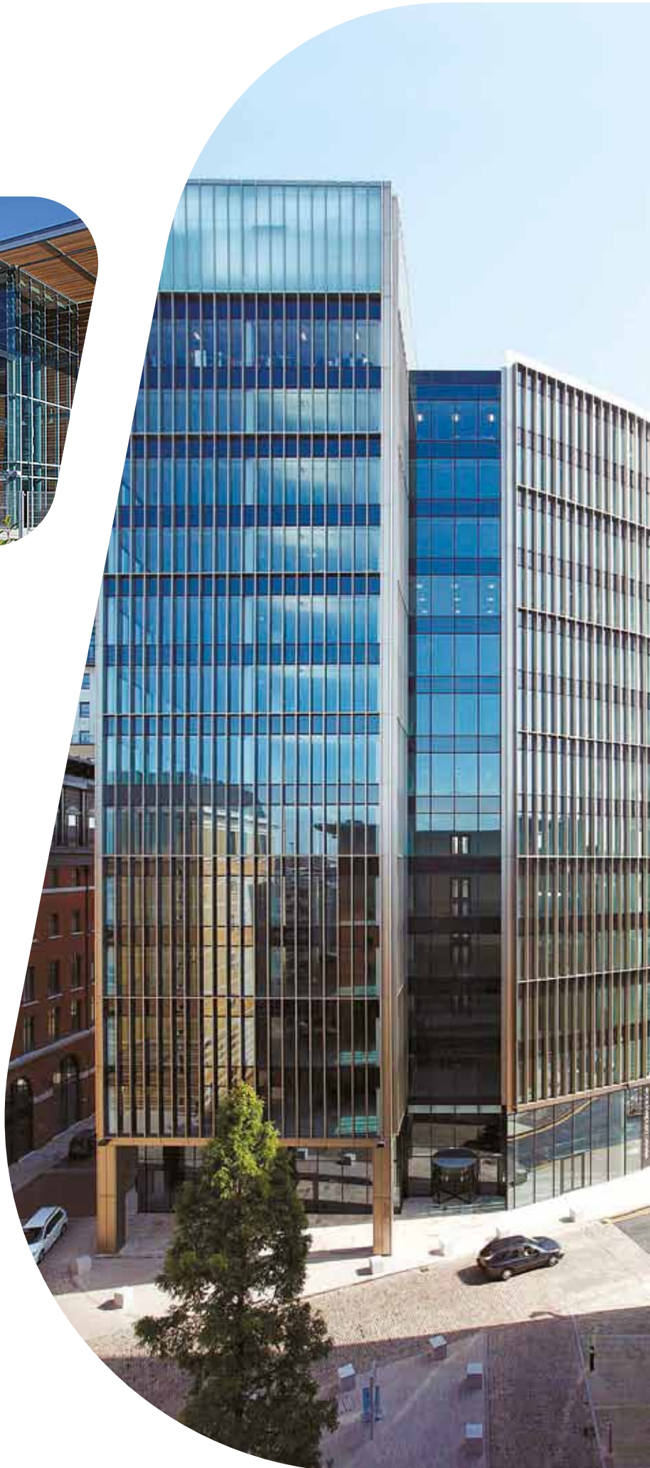
Brindley Place, Birmingham.

For more details and technical data please visit www.pilkington.co.uk , email pilkington@respond.uk.com or phone our Customer Contact Centre on 01744 692000.