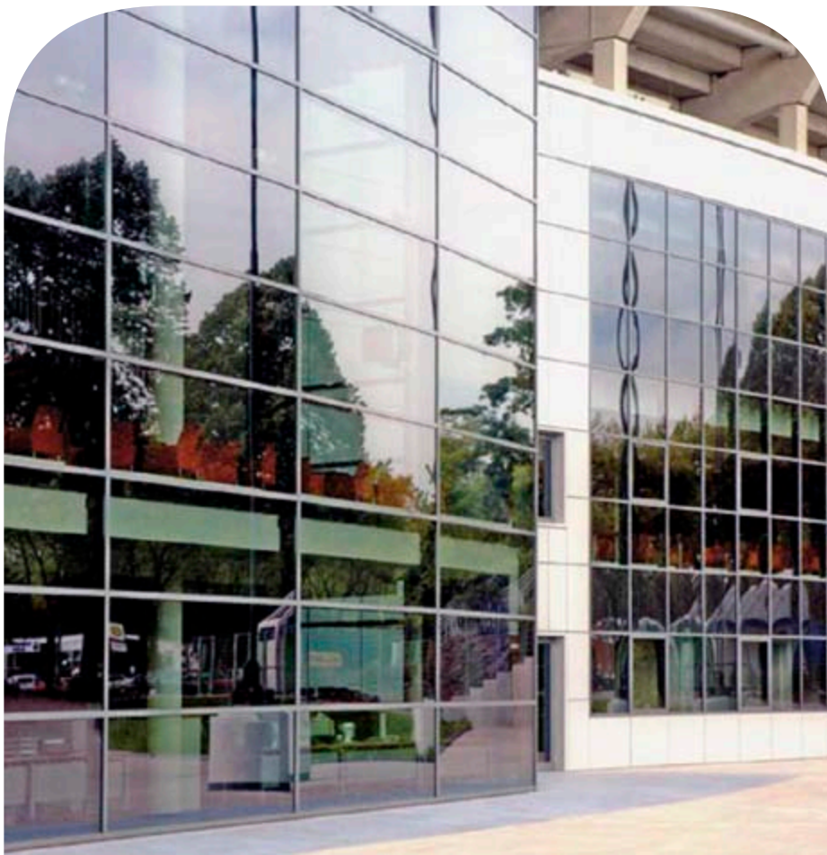
Pilkington Activ Suncool™ 53/40