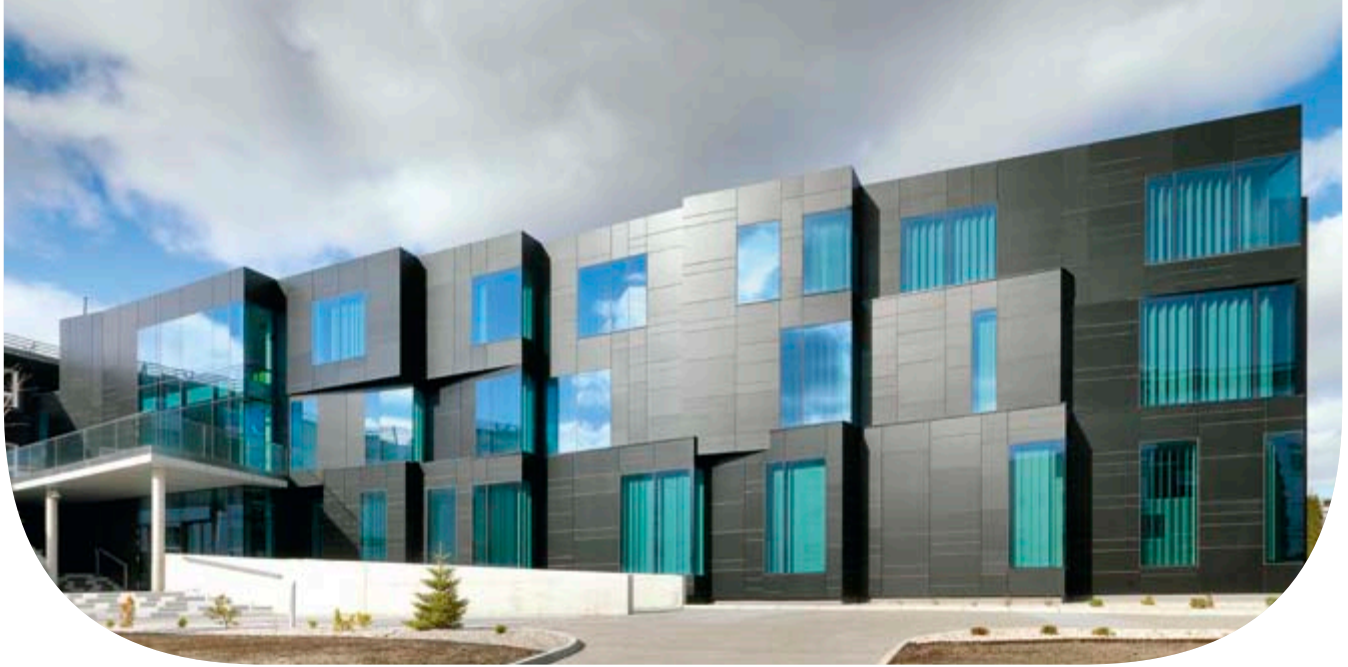
Pilkington Activ™ Blue