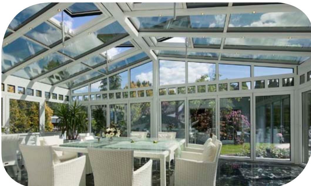
Pilkington Activ SunShade™ Neutral