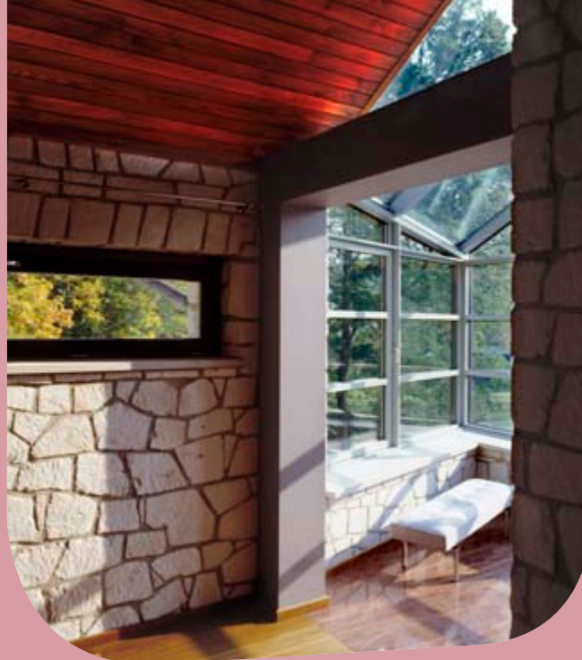
Pilkington Activ Suncool™ 70/40