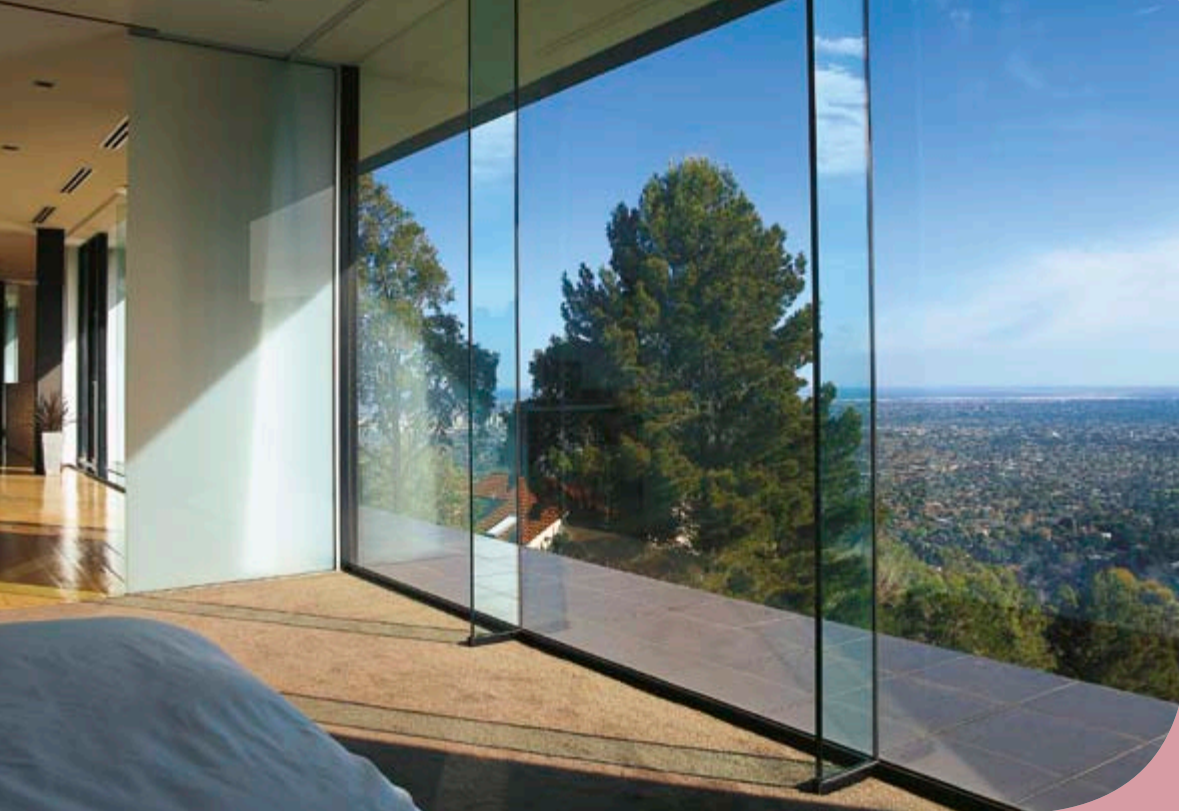
Pilkington Activ™ Clear