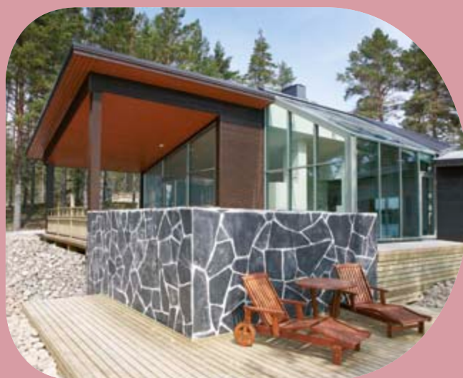
Pilkington Activ Suncool™ 70/40