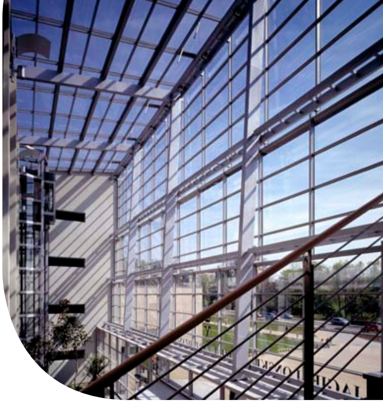
Pilkington Activ ™ Clear

Pilkington Optitherm ™ S3 low-emissivity coating, usually used on surface #3 in insulating glass units, is sometimes difficult or impossible to apply on some glass types. However, dual