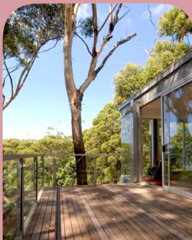
Pilkington Activ™ Clear