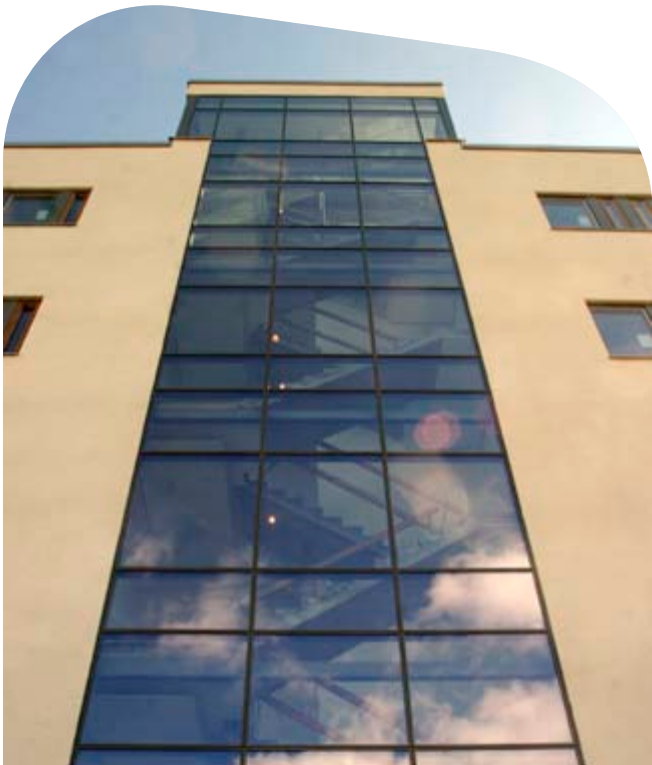
Pilkington Activ Suncool™ 70/40