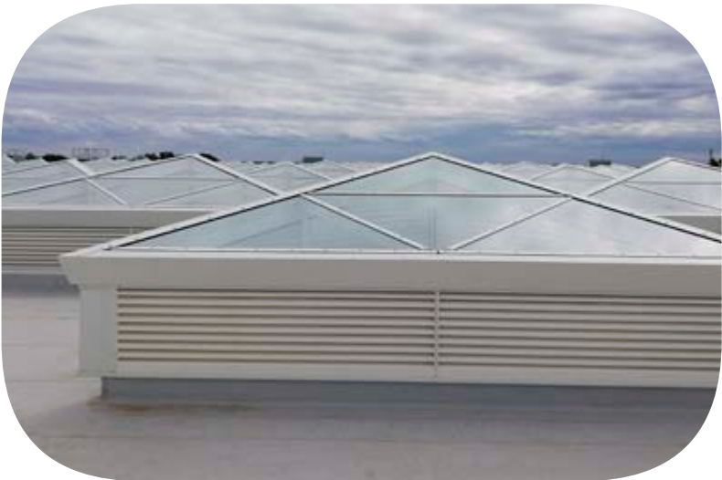
Pilkington Activ Optilam ™

Apart from the above-mentioned combinations, other configurations are possible (e.g. Pilkington Activ Suncool Optilam ™).