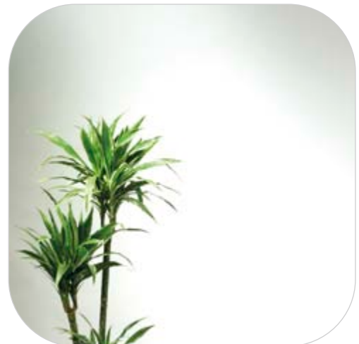
Pilkington Optimirror™ OW