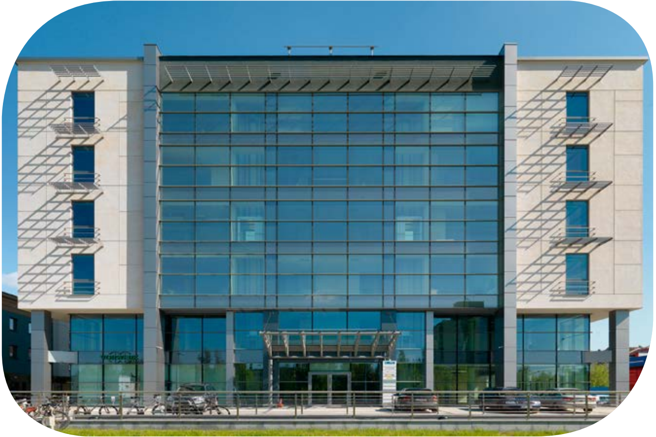
Pilkington Suncool ™ 66/33