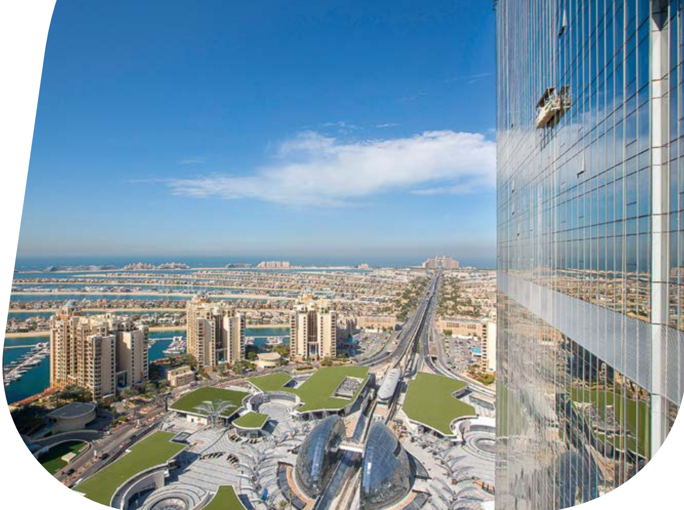
Pilkington Suncool™ One 30/21