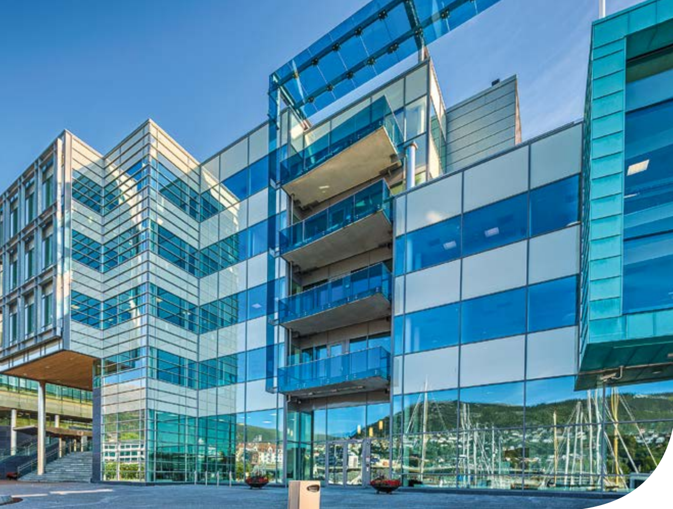
Pilkington Suncool™ 70/35