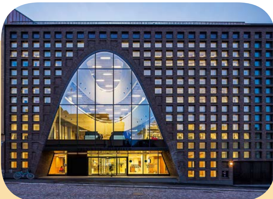
Pilkington Suncool™ 70/35 OW