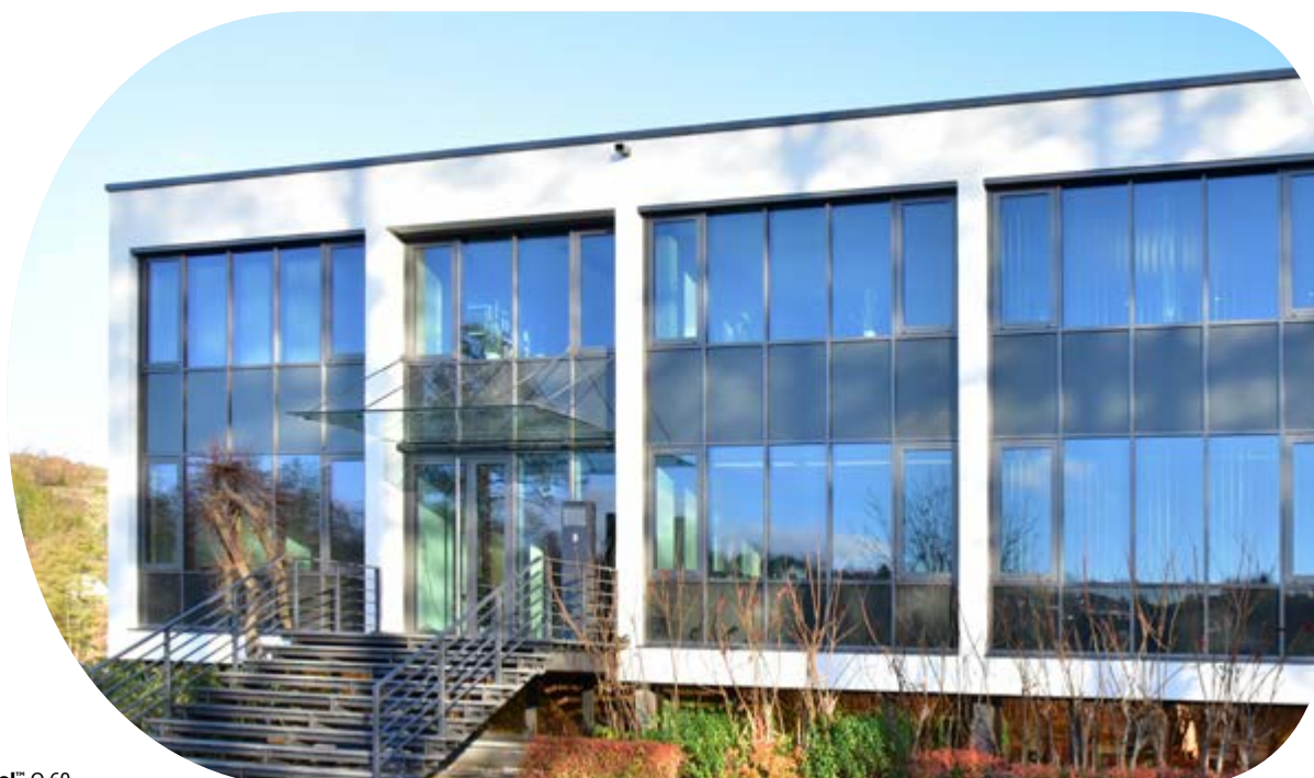
Pilkington Suncool™ Q 60

* Level of reflection: Low reflection < 15%, Medium reflection 15-25%, High reflection > 25%.