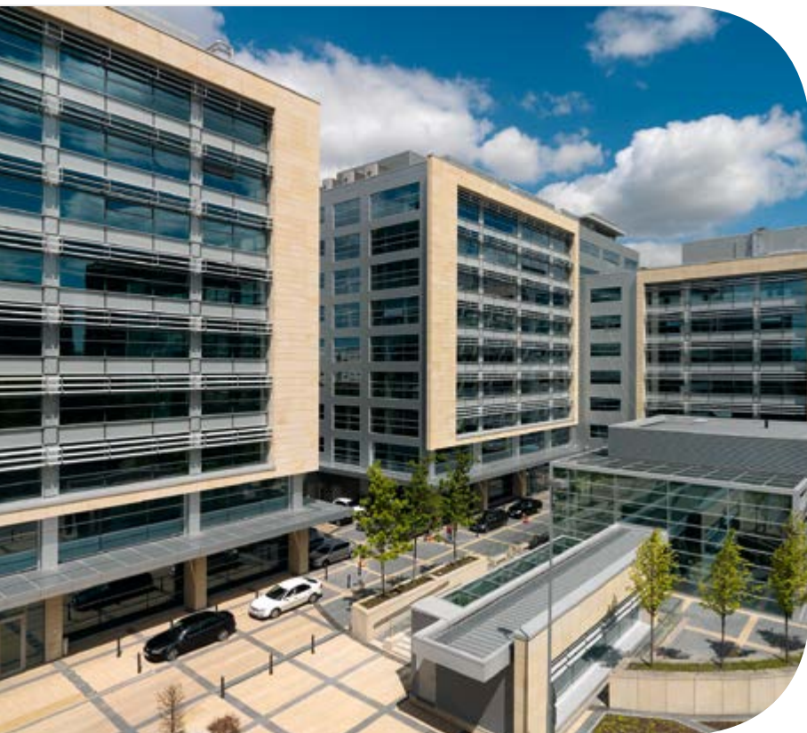
Pilkington Suncool™ 50/25