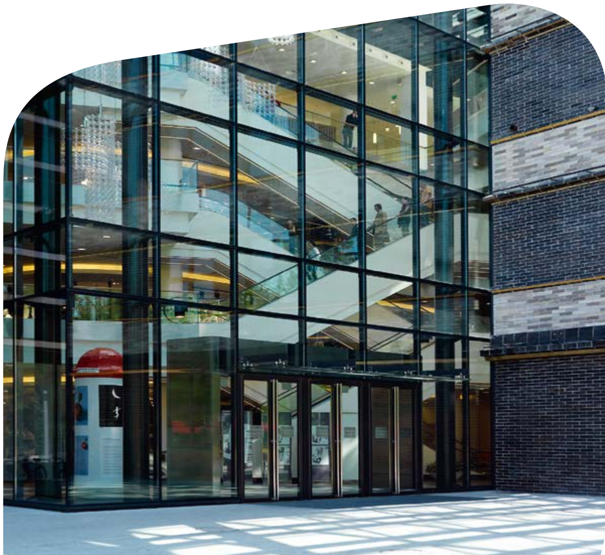
Pilkington Suncool™ 70/40 OW T