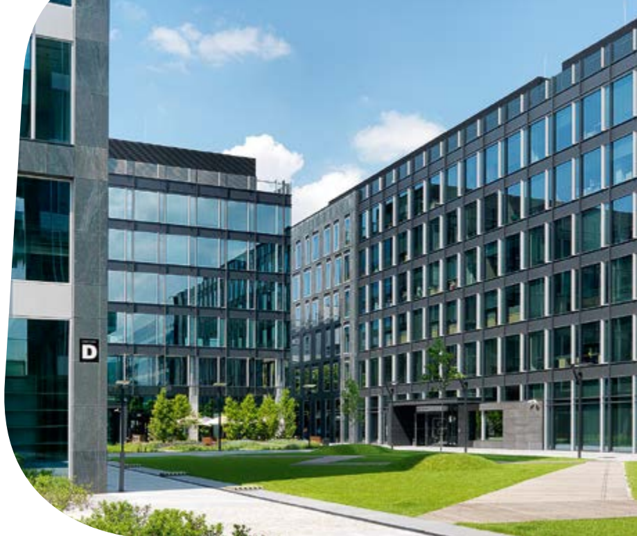
Pilkington Suncool™ 50/25