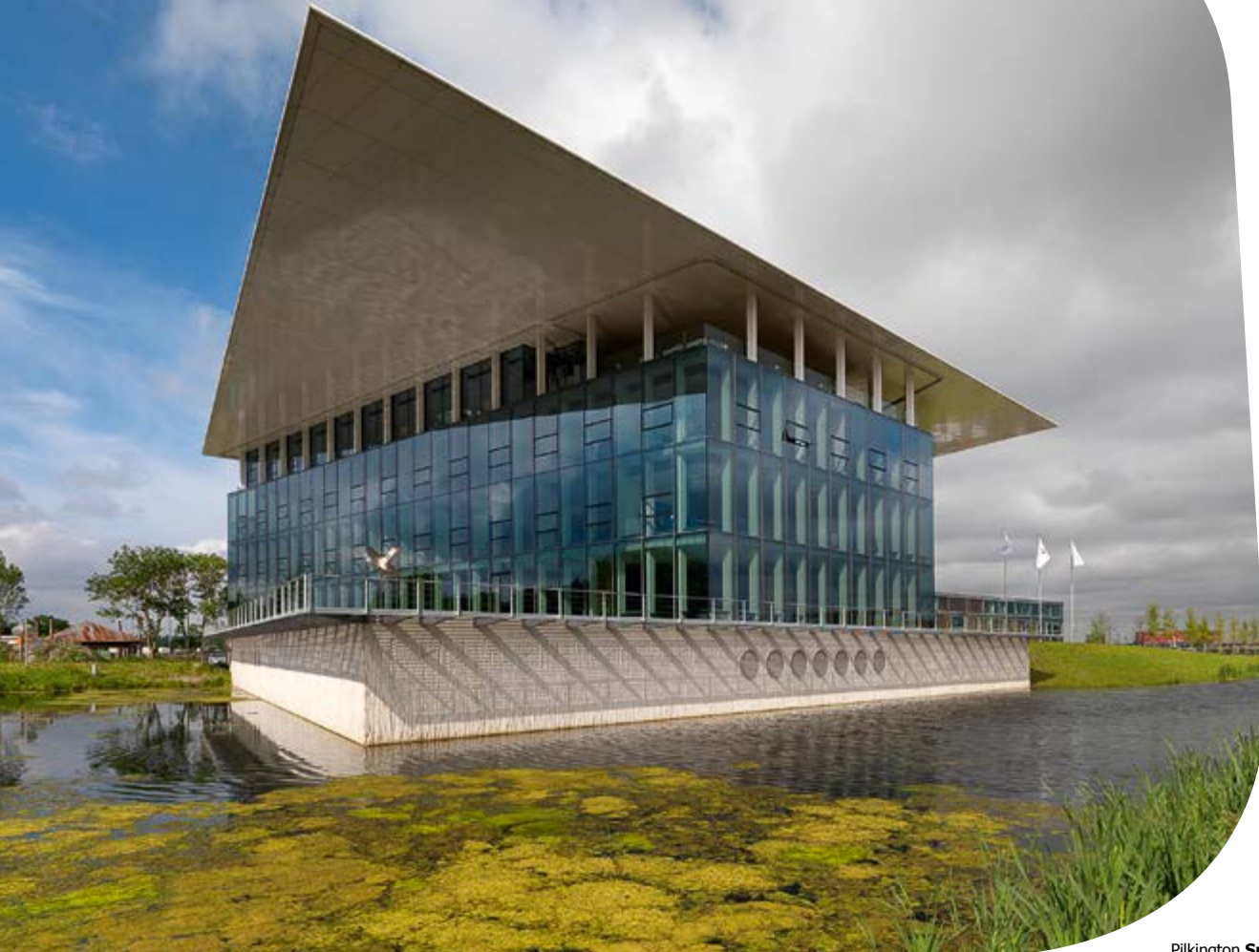
Pilkington Suncool™ 50/25