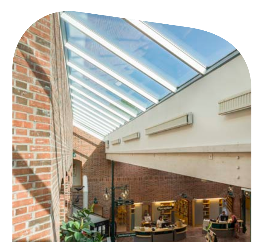
Pilkington Activ Suncool ™ 50/25