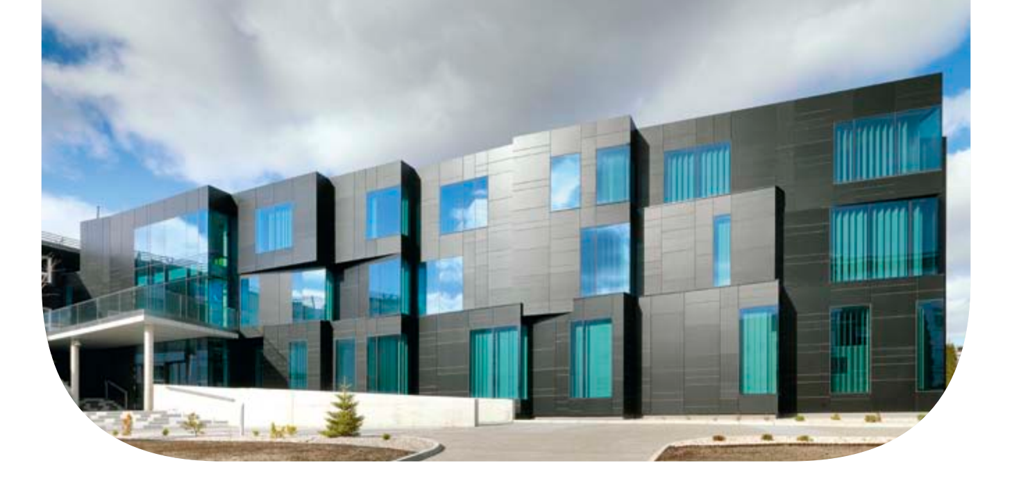
Pilkington Activ™ Blue