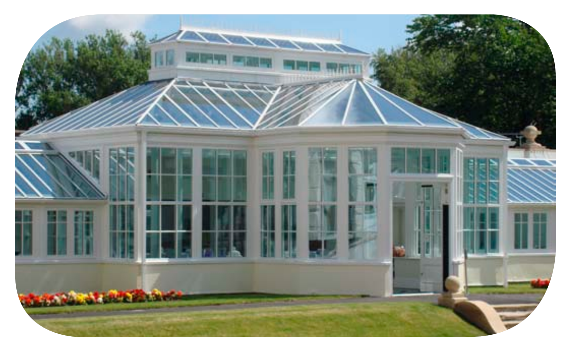
Pilkington Activ SunShade " Neutral