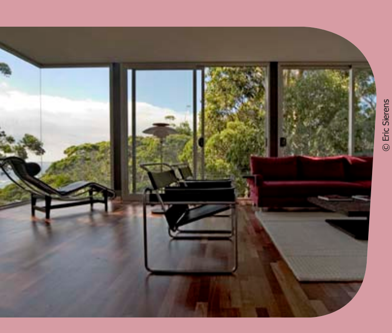
Pilkington Activ ™ Clear