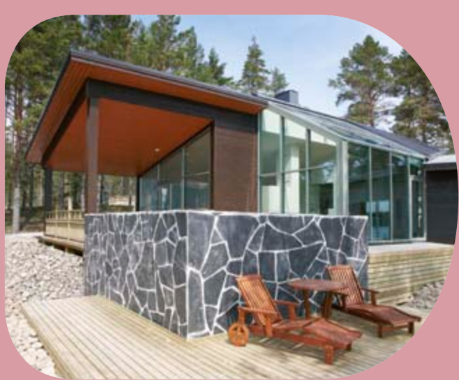
Pilkington Activ Suncool ™ 70/40