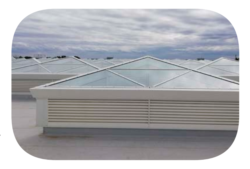
Pilkington Activ Optilam ™

Apart\ from\ the\ above-mentioned\ combinations,\ other\ configurations\ are\ possible\ (e.g.\ Pilkington\ \textbf{Activ}\ \textbf{Suncool}\ \textbf{Optilam}^{\texttt{m}}).