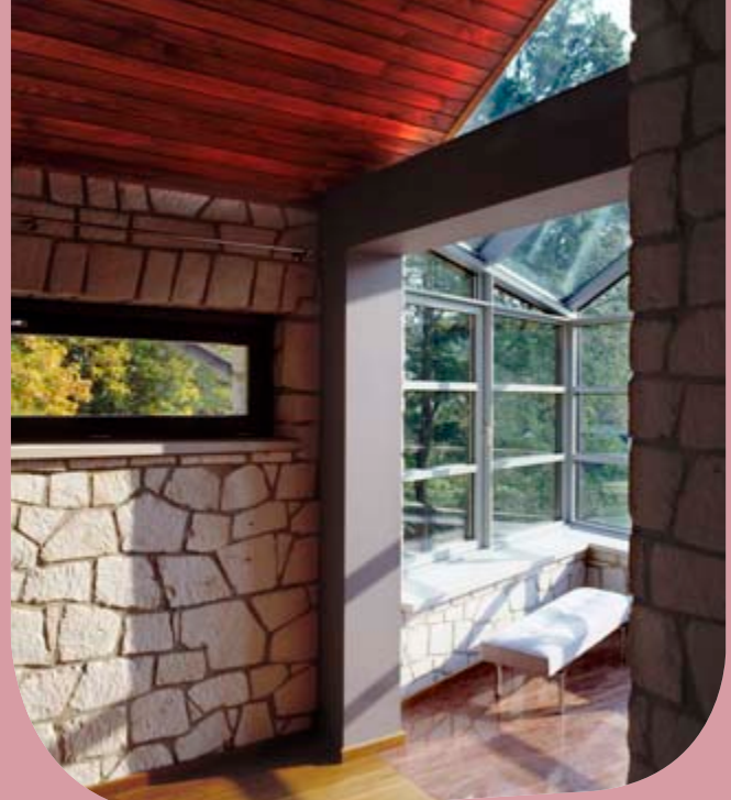
Pilkington Activ Suncool ™ 70/40