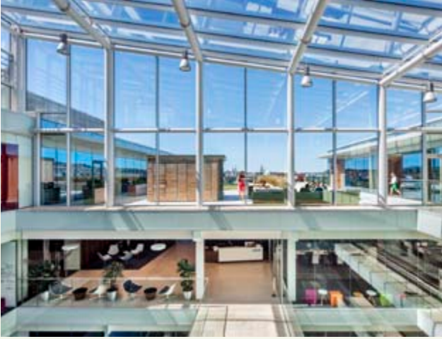
One Albert Quay in Cork, Ireland with LEED Gold