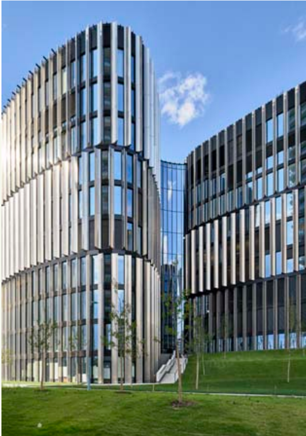
Main Point Pankrac in Prague, Czech Republic with LEED Platinum

Pilkington Optitherm™ is a range of off-line coated glass which offers the highest performance of thermal insulation. These products will provide Ug-values from as low as 1.0 W/m 2 K (Pilkington Optitherm™ S1A and Pilkington Optitherm™ S1 Plus) when used in a standard double IGU and 0.5 W/m 2 K when used in a triple IGU.