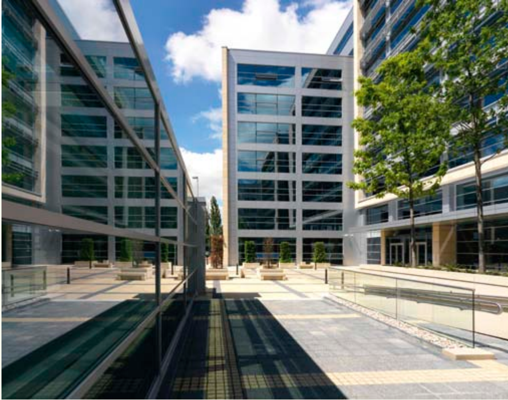
Adgar Plaza in Warsaw, Poland with LEED Gold