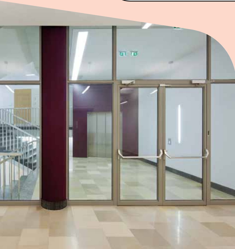
Pilkington Pyroclear ® in door and screen providing integrity and fire separation for a lift and stair lobby.