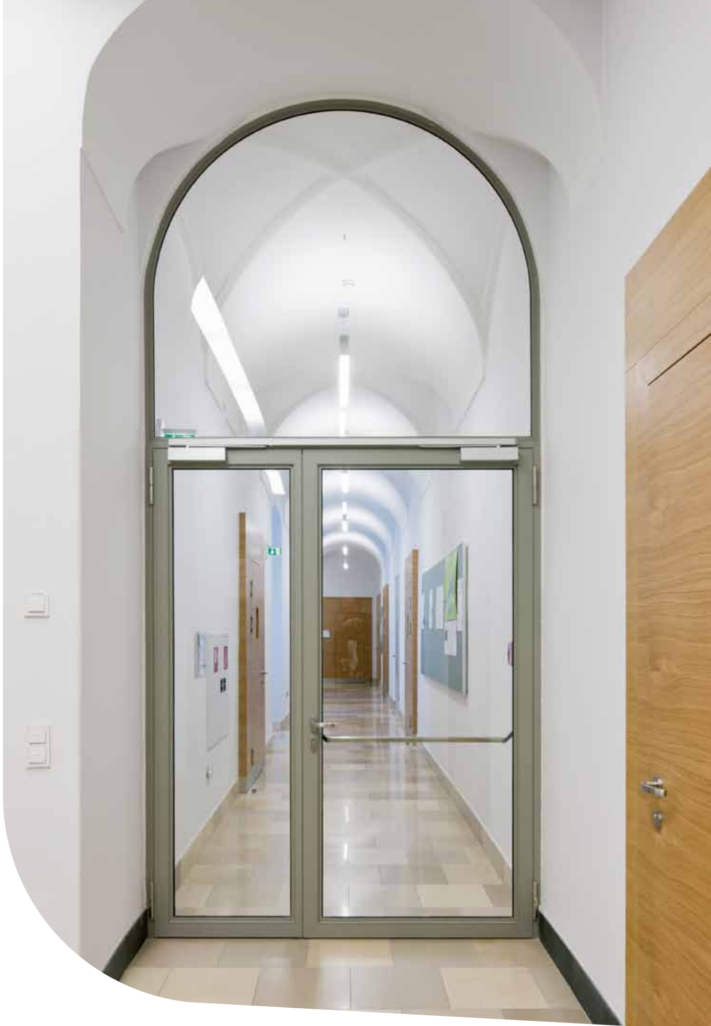
Large area double leaf door with top light - a good example of how Pilkington Pyroclear ® provides reliable integrity without compromising open design.