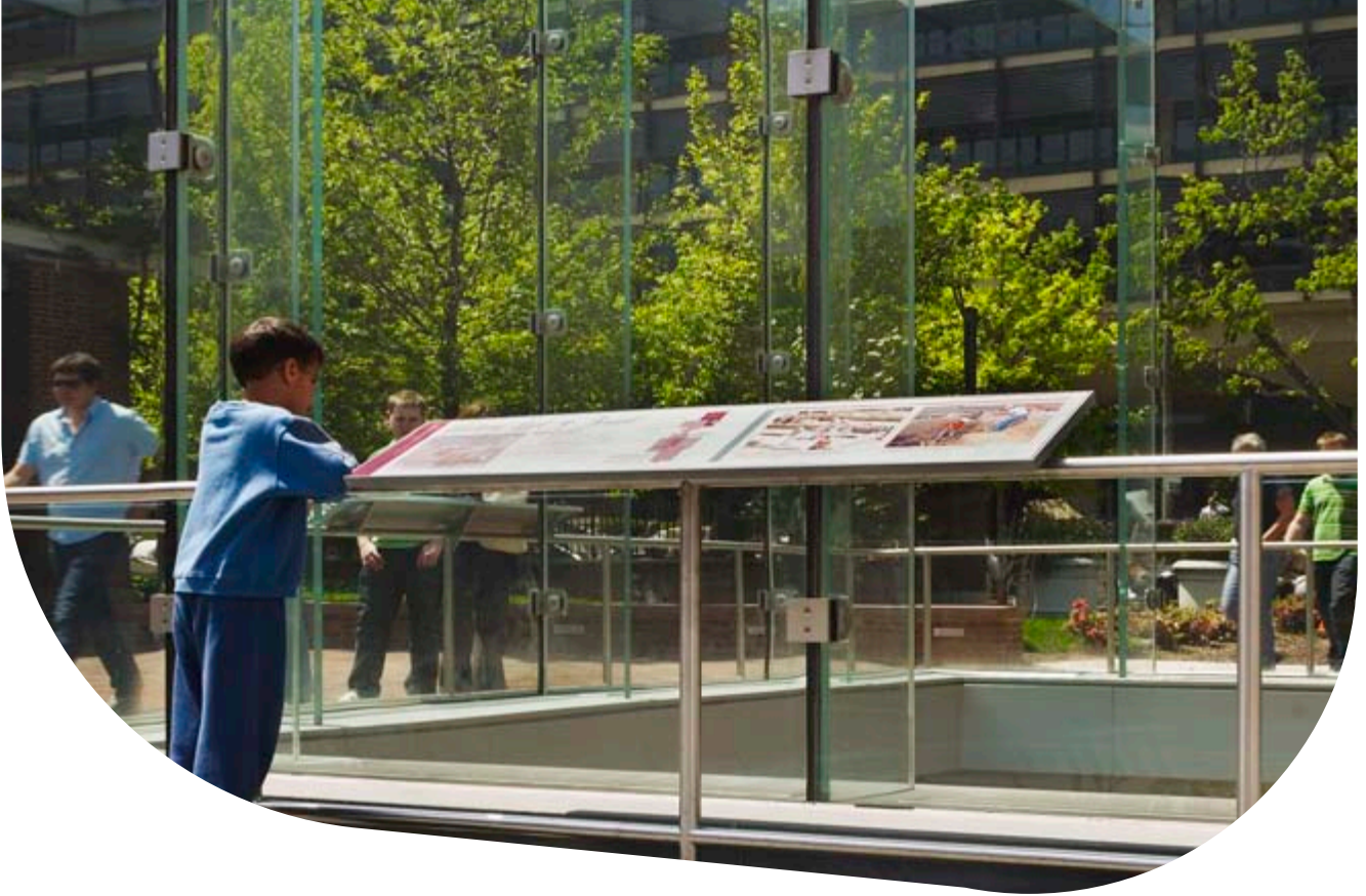
President's House, Philadelphia, Pennsylvania, USA