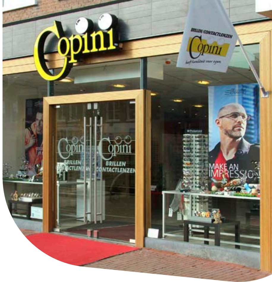
Copini Opticiens, Sneek, The Netherlands

Pilkington OptiView™ Protect can help protect against break-ins and theft. Standard glass can be easily broken, allowing burglars easy access. The interlayer provides a safeguard against intrusion by remaining intact even when glass is broken.