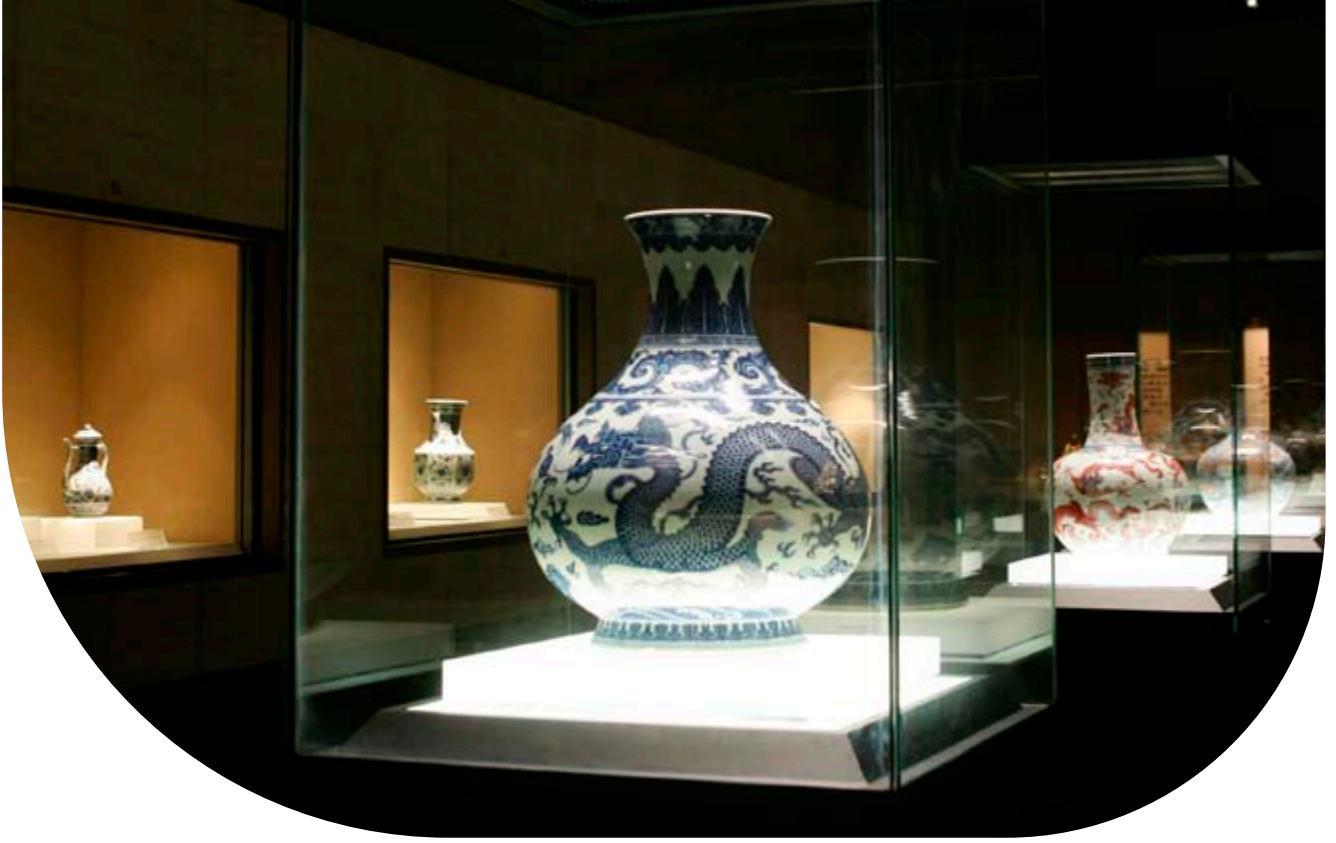
Beijing Museum, China