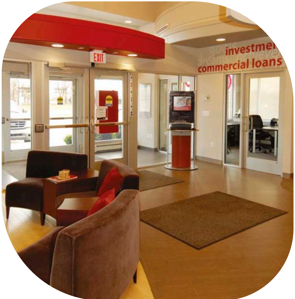
Flagstar Bank, Michigan, USA