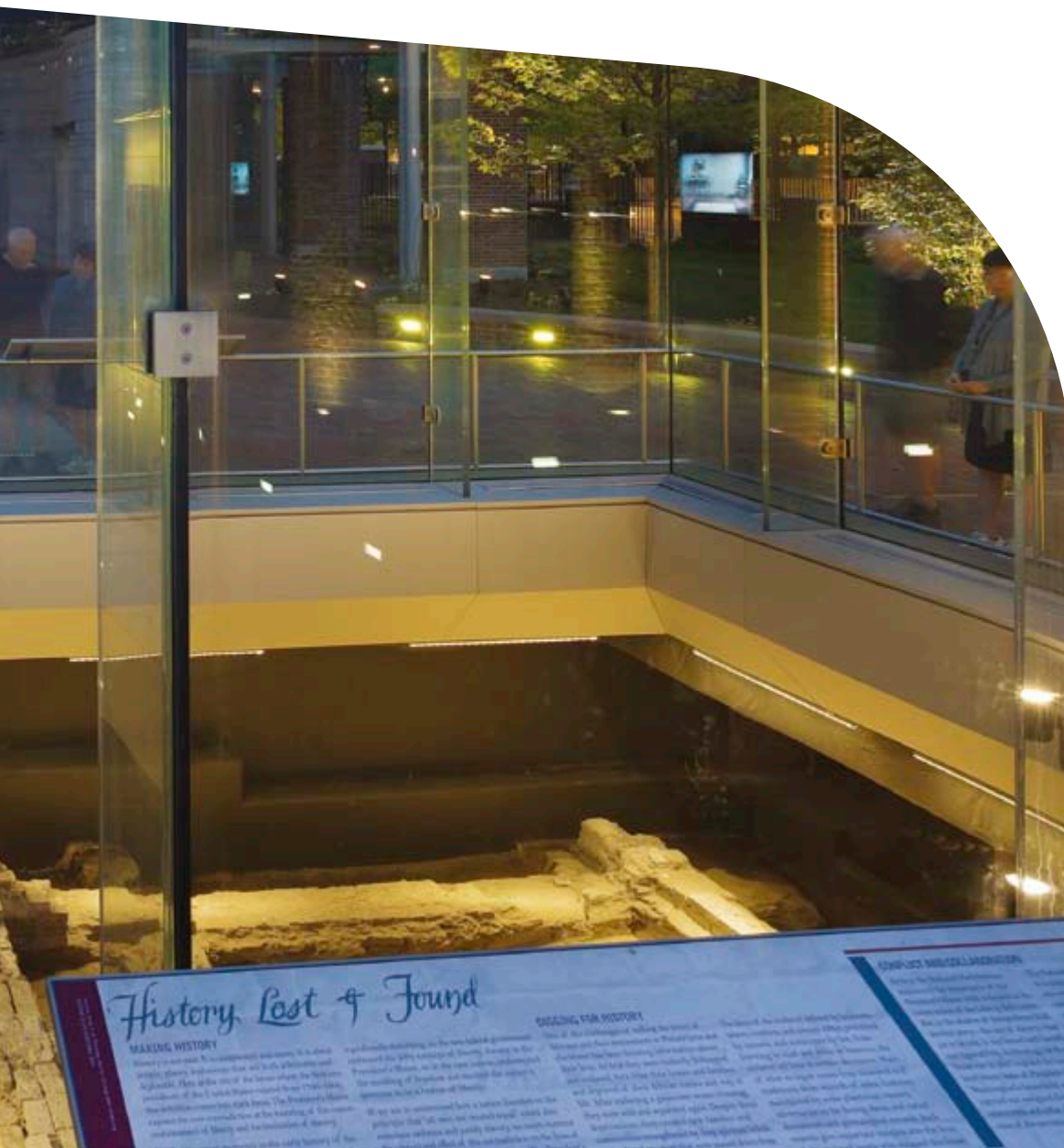
President's House, Philadelphia, Pennsylvania, USA