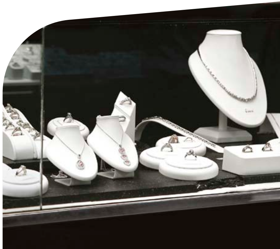
J. Foster Jewelers, Ohio, USA

Pilkington OptiView™ Protect provides an excellent barrier to noise. The laminated panes provide insulation against audio disturbances by dampening the sound.