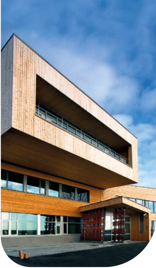
© Bent Raanes and Sarah Sørensen

The design is based on simple geometric lines laid into a complex arrangement of rooms and functions.