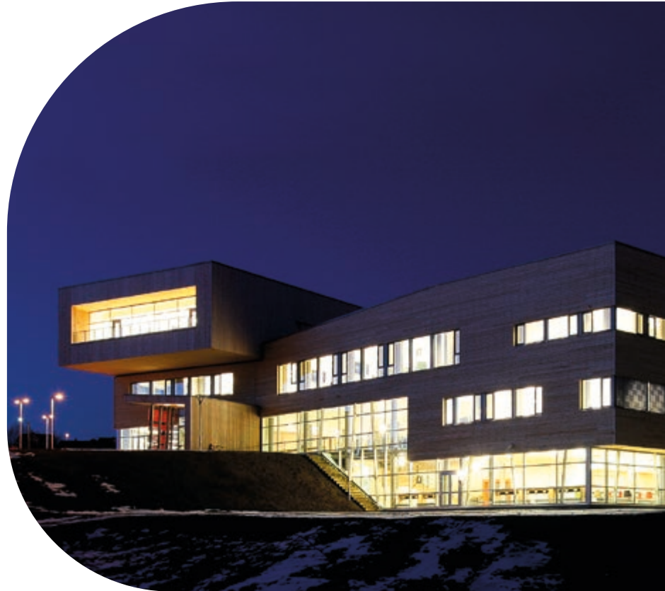
© Bent Raanes and Sarah Sørensen

The design is based on simple geometric lines laid into a complex arrangement of rooms and functions.